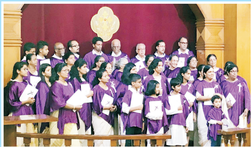
Area wise group singing competition 2nd prize CBD Belapur Prayer Group