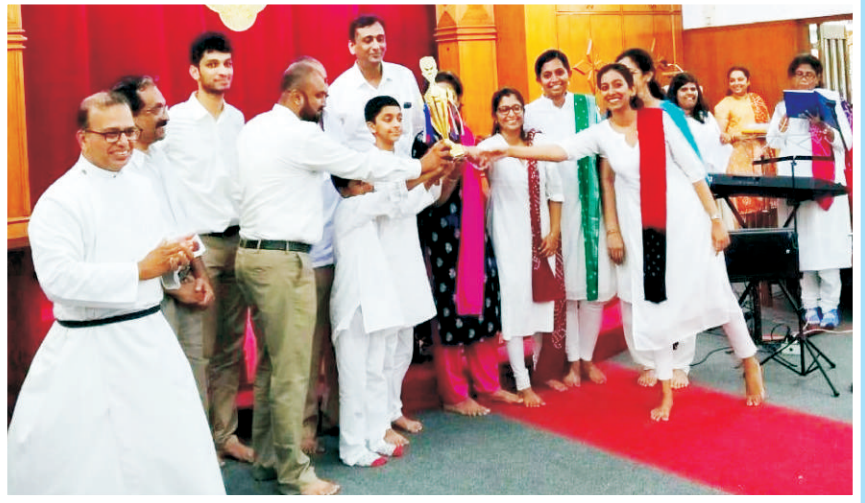
Area wise group singing competition 3rd prize Vashi-C Prayer Group