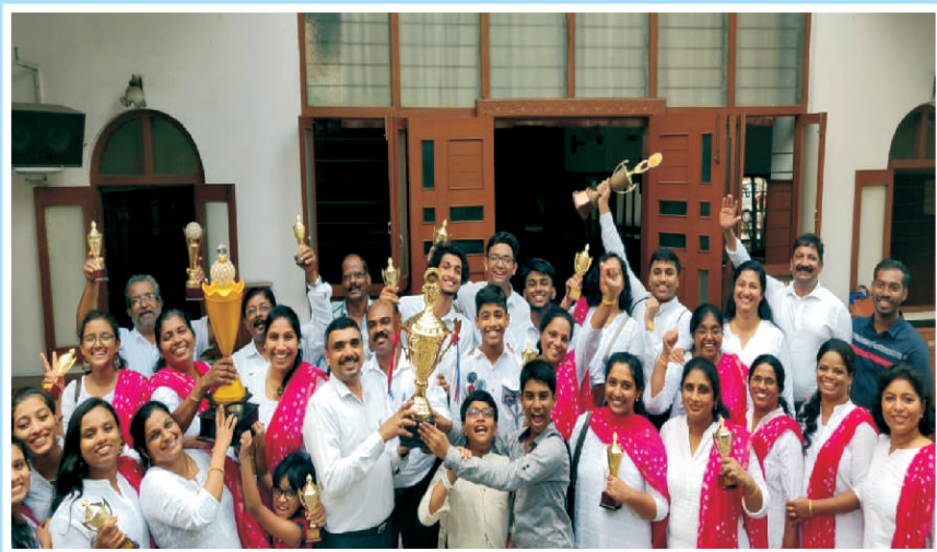
Area wise group singing competition 1st Prize & Overall Champions Airoli Prayer Group