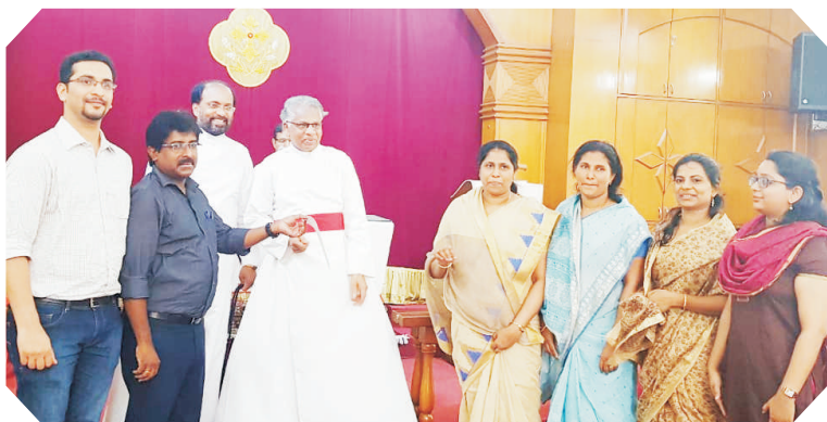
Koper Khairane Prayer Group – Second Prize