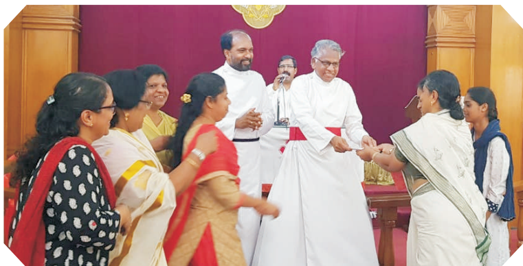
CBD Belapur Prayer Group – Third Prize