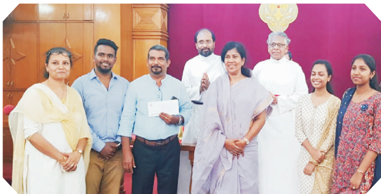
Nerul Palmbeach Prayer Group – First Prize