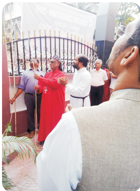
Republic Day Flag Hoisting