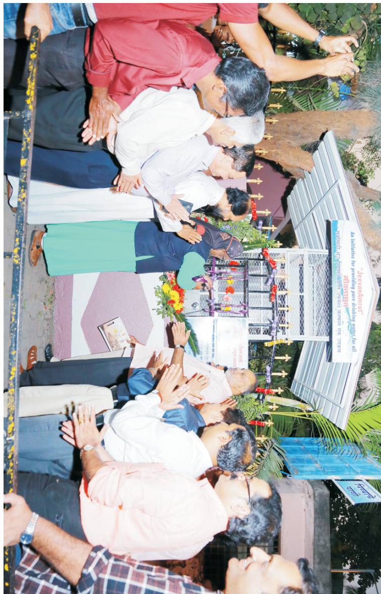
Inauguration of JeevanAmrut